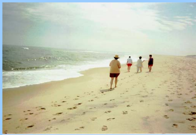
Great nature paths, as well as great beach.