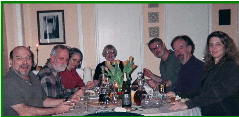
Thanksgiving Dinner with Friends