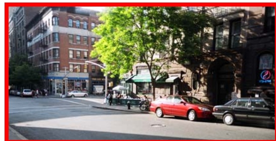
Louie's: A Favorite Restaurant